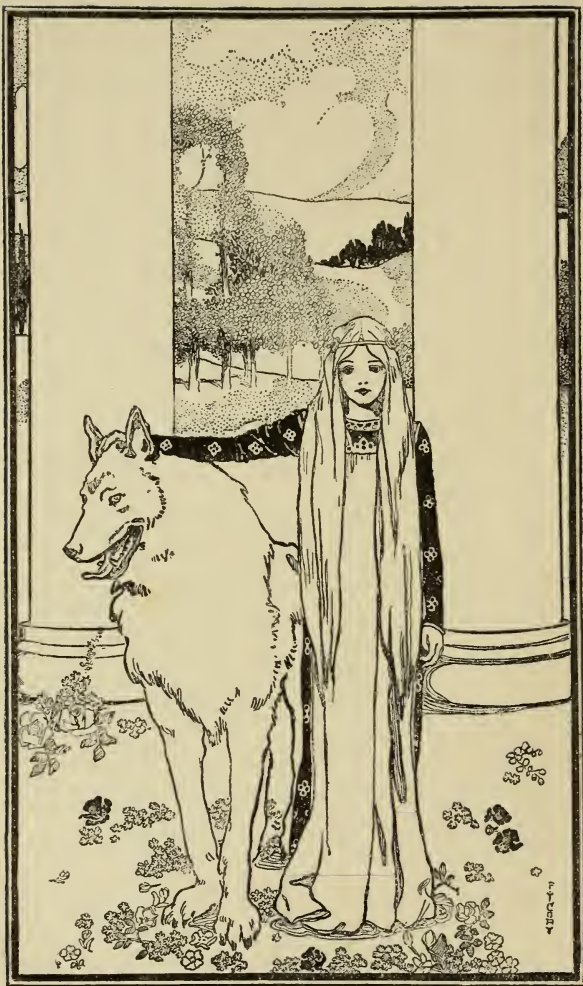
ST. BRIDGET & THE KING'S WOLF